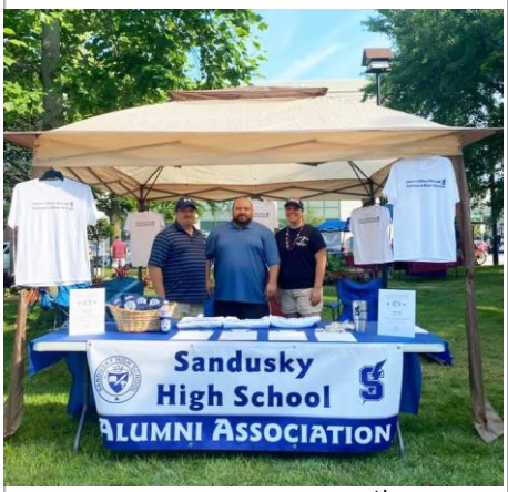
See you at the July 4<sup>th</sup> Community Celebration!